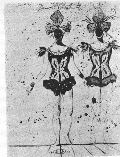
Backdrop and Costumes for the DANSES CONCERTANTES of IGOR STRAVINSKY