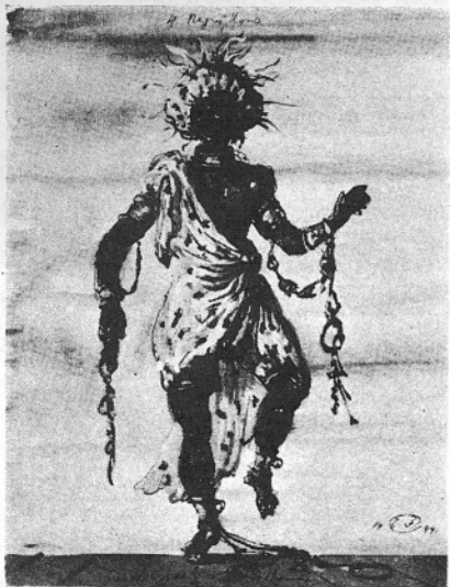
Figures in LE BOURGEOIS GENTILHOMME Orchestral Suite by RICHARD STRAUSS